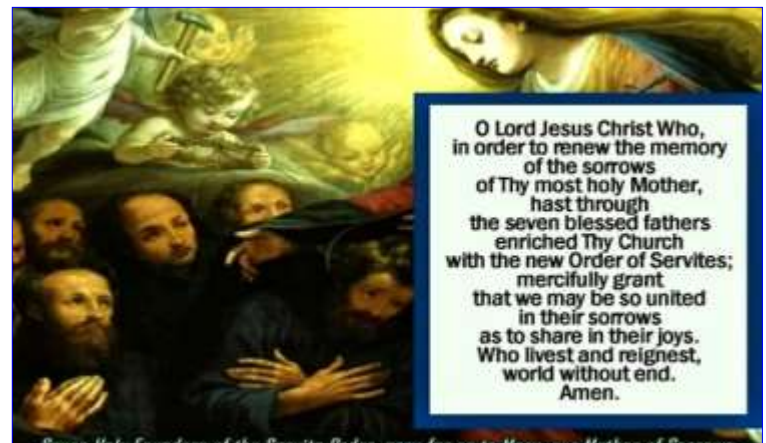
Sevan Haly Faunders of the Servite Order, pray for us to Hery, our Mather of Serrows.